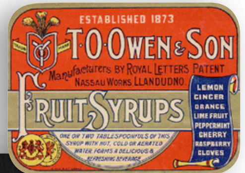
Bottle label from Llandudno based drinks manufacturer, T.O. Owen and Son, established in 1873

People's Collection Wales allows you to search content housed in our online collection and, more importantly, contribute material to create your own digital story. Everyone has some piece of the jigsaw that tells the story of Wales, be it a memory, a letter or an old photograph. Items such as these are often forgotten, lost or discarded. Sharing them with People's Collection Wales helps to enrich Wales' cultural heritage and ensures that it is preserved for future generations.