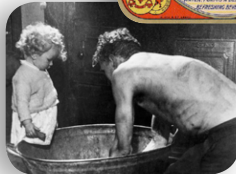
Miner washing at home in a tin bath

People's Collection Wales allows you to search content housed in our online collection and, more importantly, contribute material to create your own digital story. Everyone has some piece of the jigsaw that tells the story of Wales, be it a memory, a letter or an old photograph. Items such as these are often forgotten, lost or discarded. Sharing them with People's Collection Wales helps to enrich Wales' cultural heritage and ensures that it is preserved for future generations.