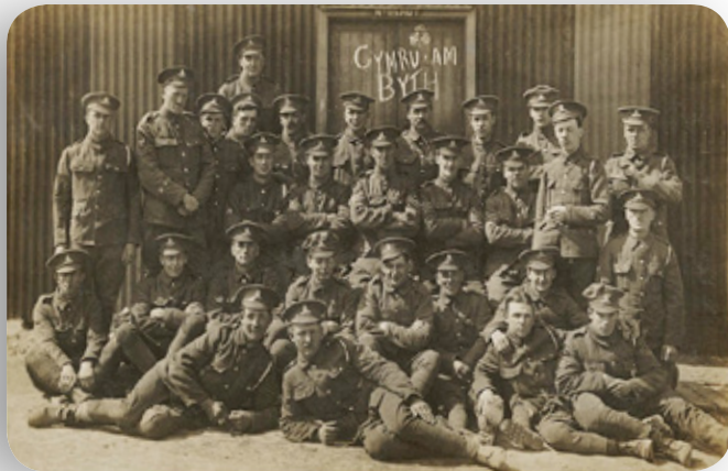
A photograph of a Welsh regiment during WW1 with 'Cymru am Byth' painted on the door behind them

The website currently features thousands of items and has recently been re-launched with an improved user experience in mind.